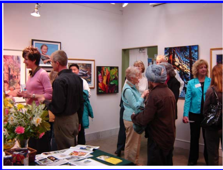
Opening Reception, Spring Show 2009

Our Victoria Chapter juries for Active status once a year (this year, on September 26), however, at any time during the year you can be juried through the Vancouver FCA - send ten images as digitals or slides, no originals needed. The Vancouver cost for digital entry is $11 dollars, $10 for slides. Info and forms downloaded at FCA website www.artists.ca