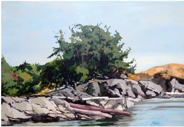
Jim McFarland, Glencoe Cove